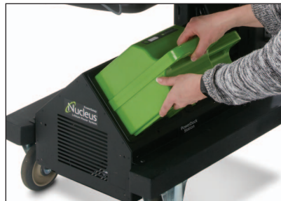
Swap it with a freshly charged pack in a matter of seconds