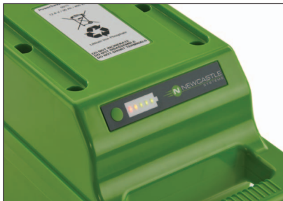
Easy to read LED power level indicator