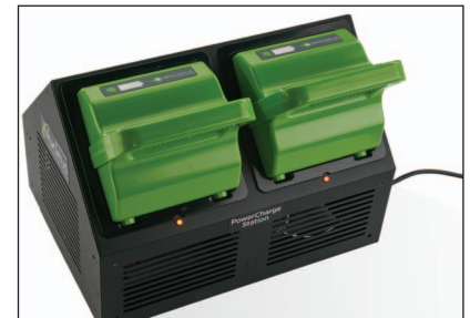
Stand alone battery charging station Footprint: 16" W x 11 5/8" D x 11 1/2" H Weight: 20 lbs.

**Lithium Safety Concerns** The PowerSwap Nucleus battery employs lithium-iron phosphate technology, which is significantly more stable than standard lithium-ion or lithium-polymer solutions. Unlike these chemistries, lithium-iron phosphate batteries are not subject to potentially dangerous ignition events when subjected to over-heating or mechanical abuse.